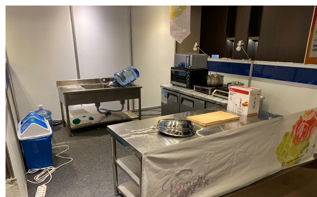
Placement of the cooking utensils in the booth