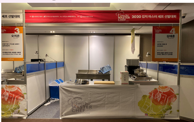
Cooking booth for each team